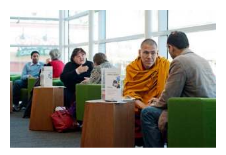
Step 3: Choose location