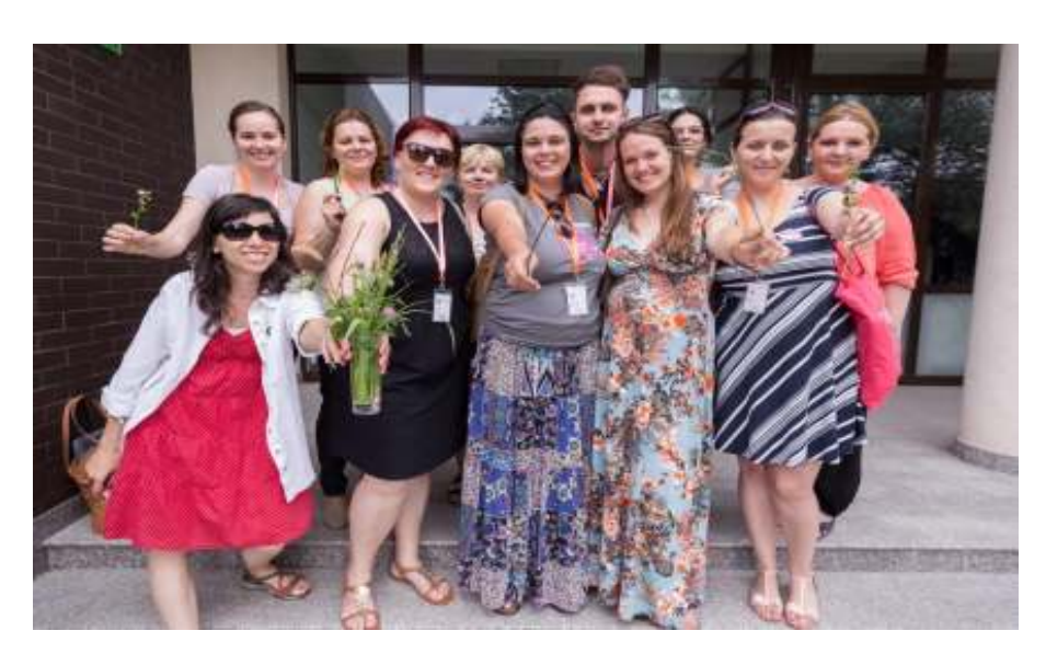
During Connector teamwork

as communication strategy development and implementation, graphic design, social media, fundraising, but also good planning and organising abilities.