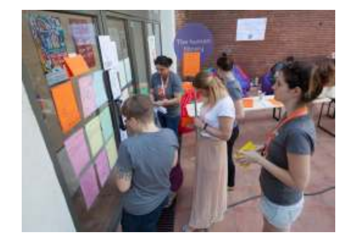
During Connector- borrowing desk