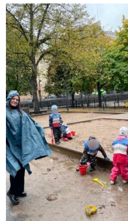
Video 3: As it was Harry Styles from 00:03:02